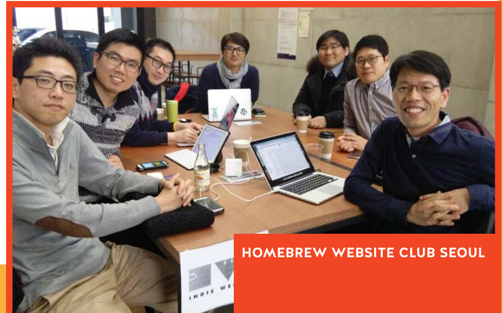
HOME BREW WEBSITE CLUB SEOUL

There are Homebrew Website Club meetups in dozens of cities around the world, at varying schedules from biweekly to monthly. The meetups start with having each person share something they recently changed or added to their website, and the discussions evolve from there.