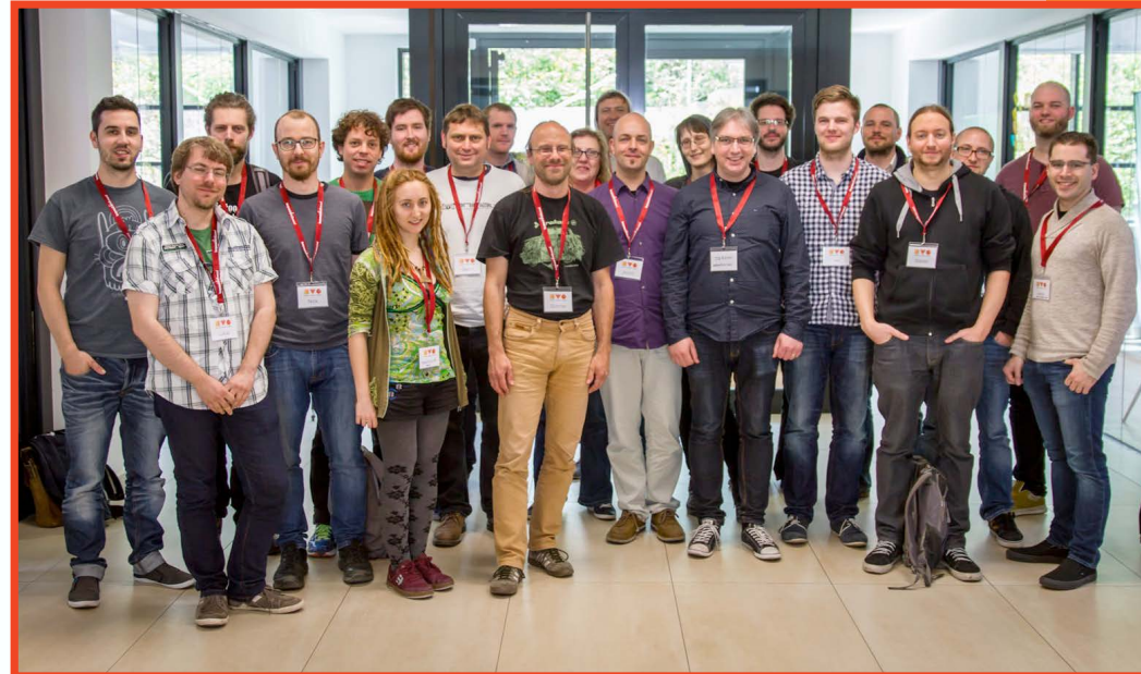
INDIEWEBCAMP GERMANY 2015