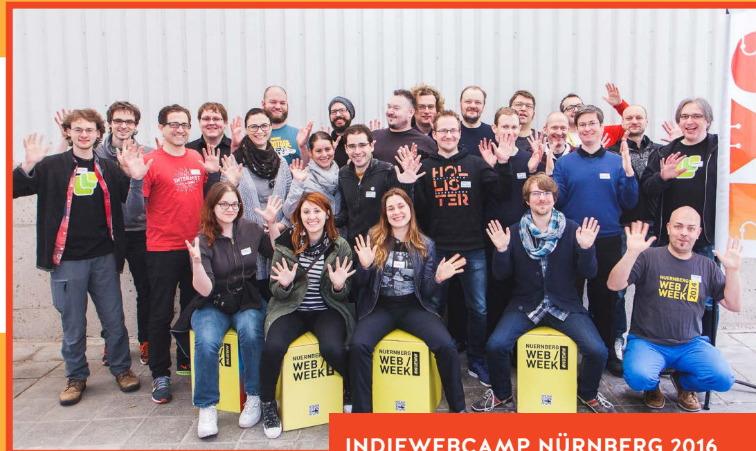
INDIEWEBCAMP NÜRNBERG 2016

IndieWebCamp is a two-day gathering of web creators building and sharing open web technologies to advance the state of the Web.